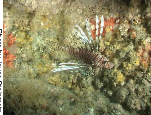
A lion fish swimming on the wreck of the Dixie Arrow